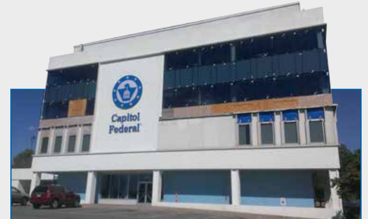
Capitol Federal Bank Building during repairs.

As buildings are exposed to weather and time, they can be in need of refurbishing. Such is the case with the Capitol Federal Bank building at Nall and 95th in Overland Park. Restoration and Waterproofing Contractors, Inc., was subcontracted to clean and remove all exterior sealants. RWC then replaced all of the old exterior sealants with new material. After the materials cured, RWC installed an elastomeric coating to all remaining exposed aggregate panels, which brightened up the exterior. This project's RWC foreman was Scott Pankratz.