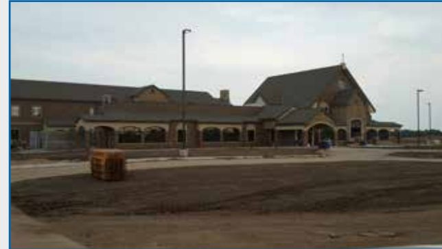
Immaculate Heart of Mary Convent & Chapel.

Restoration and Waterproofing Contractors, Inc., in Wichita has been working with Dondlinger Construction on building the new Immaculate Heart of Mary Convent and Chapel just south of Colwich. In 1976 three sisters came to Wichita following a directive from Rome and established the order. They have grown to 22 women and have never had a permanent home. This construction represents the first community to construct a convent in the state of Kansas in more than 100 years.