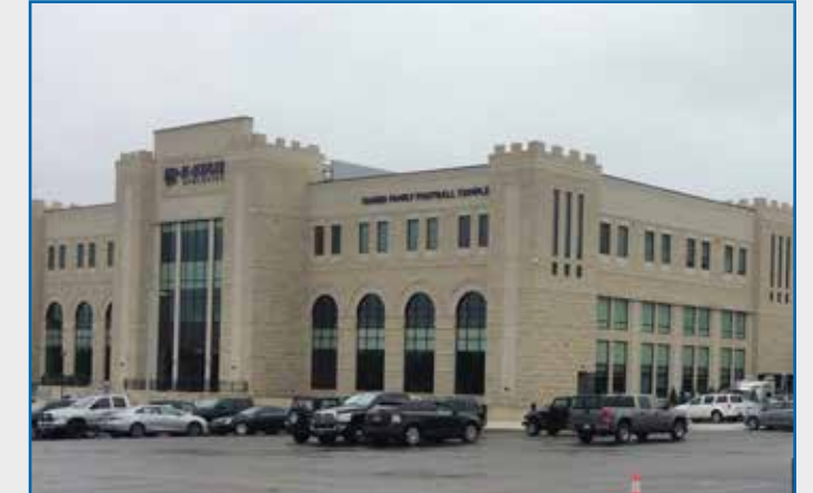
Completed north end zone renovations at the Kansas State University Vanier Football Complex.